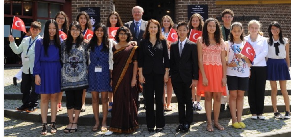
Winners Worldwide | Cologne, Germany