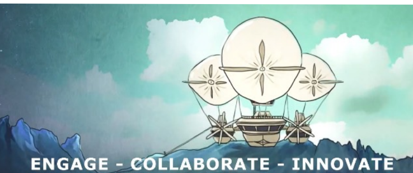
Cahill, et al., Australia