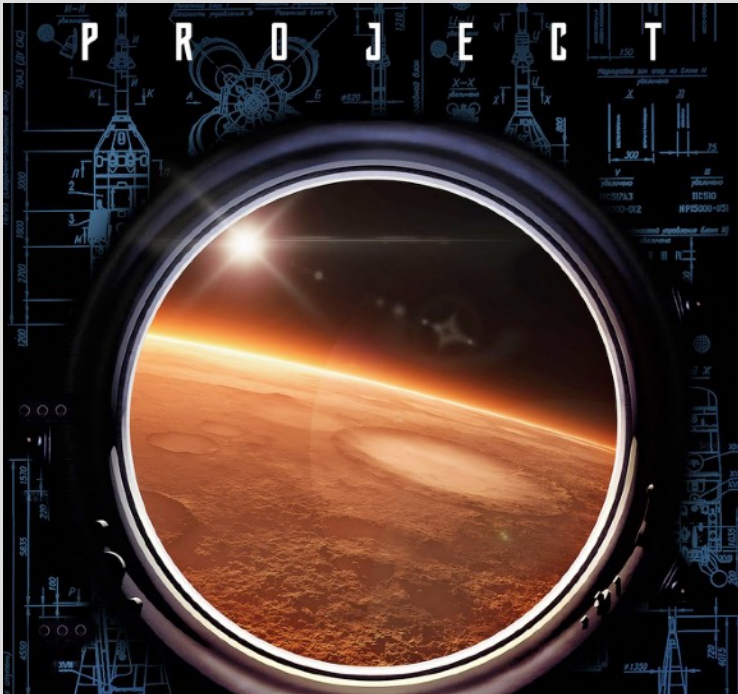
Edwin Nchaga | Kenya