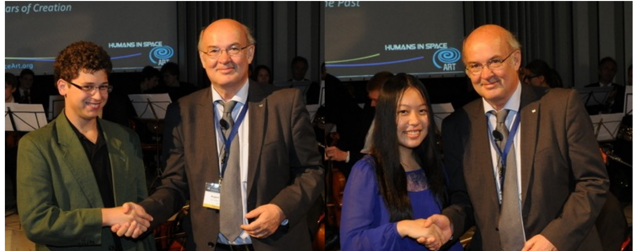
Youth Artists Receive Awards at Ceremony