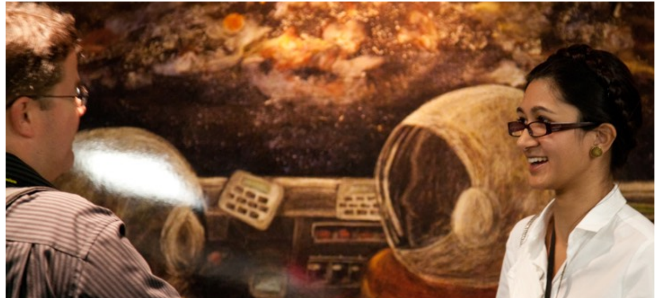
Youth Artist Discusses Artwork With Event Attendee